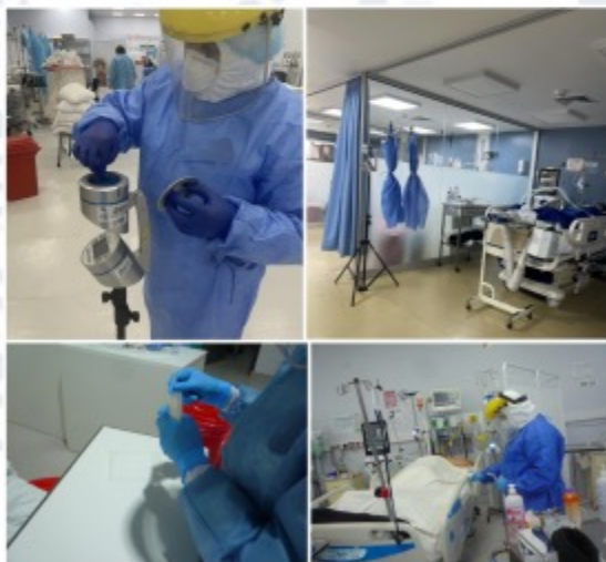
Figure 1. Sampling. (a) Multi-hole Microbiological Air Sampler (MAS-100 NT, Merck). (b) Air sampling at 1.5 mts. (c) Patient food table sampling using the Swab method. (d) Hospital bed rails sampling using the Swab method.

We designed a cross-sectional study with random convenience sampling. We selected 2 points to air sampling (0,7 mts and 1,5 mts), 5 inanimate surfaces (door handle, keyboard, desk, faucet and floor) and 10 medical equipment (2 hospital bed rails, 2 patient food table, 2 infusion pump, 2 medical cart and 2 clinic history).