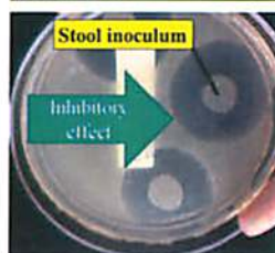
Figure 1. Stool inhibition of STEC strains.