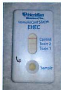
Figure 2. ImmunoCard STAT! EHEC positive for STEC (Meridian Bioscience, Inc.)